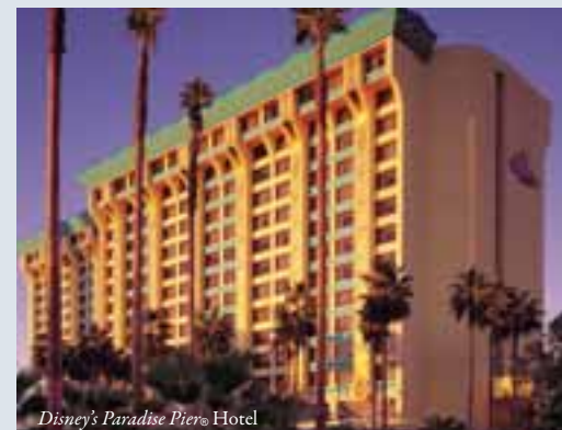
Disney's Paradise Pier® Hotel

If you are flying to Anaheim for this meeting, the Orange County Airport (SNA), is the closest airport. However, shuttle service is available from both SNA and the Los Angeles Airport (LAX). For shuttle info, contact the hotel at 714-956-6425.