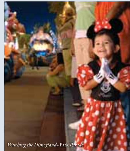
Watching the Disneyland ® Park Parade