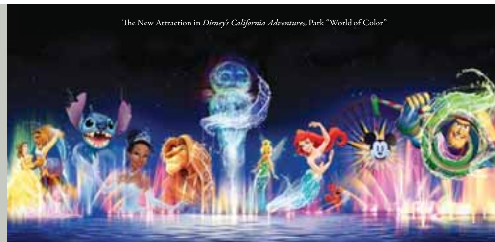
The New Attraction in Disney's California Adventure® Park "World of Color"